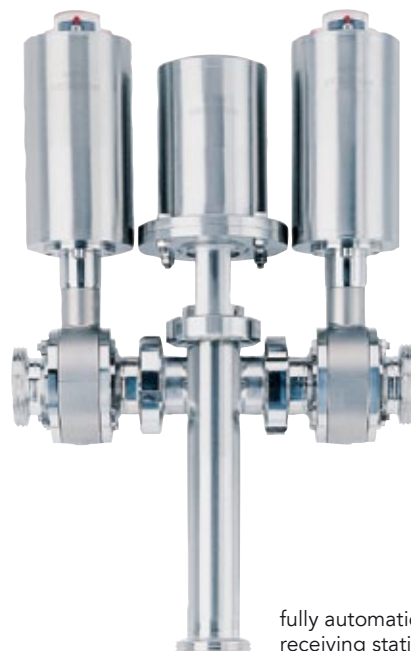
fully automatic pig receiving station