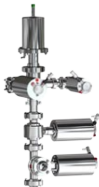
Pig launching station (hygienic version)