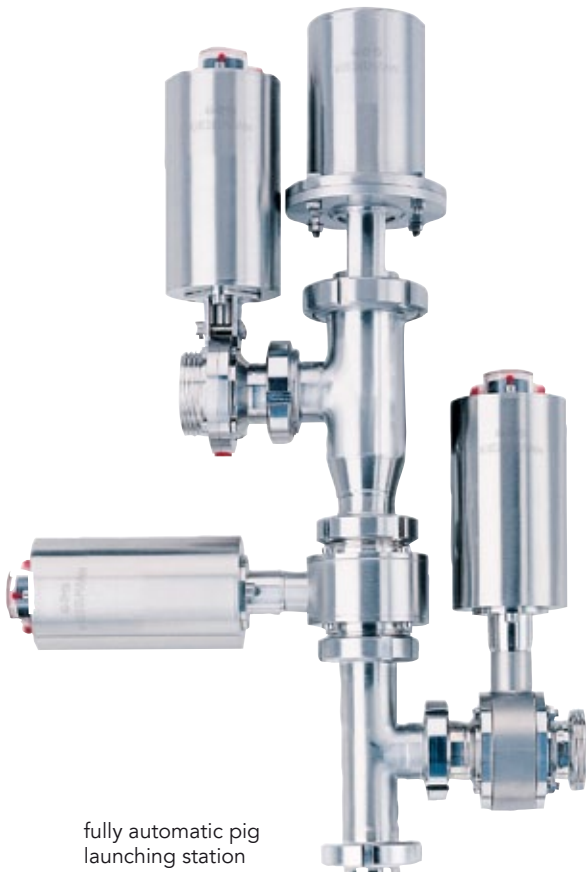
fully automatic pig launching station

To do so KIESELMANN has developed the electronic control KI-TOP specifically for valves. This valve control provides the intelligence to realise automation of the Duplex pigging process right on-site. With KIESELMANN's automation technology you will be in the position to easily realise a significant reduction in time and labour required for wiring, a reduction in installation times; you will simplify the start-up, enjoy extensive yet easy-to-use error analysis capabilities, and above all you will increase your system's safety and save up to 30% in costs for the control system.