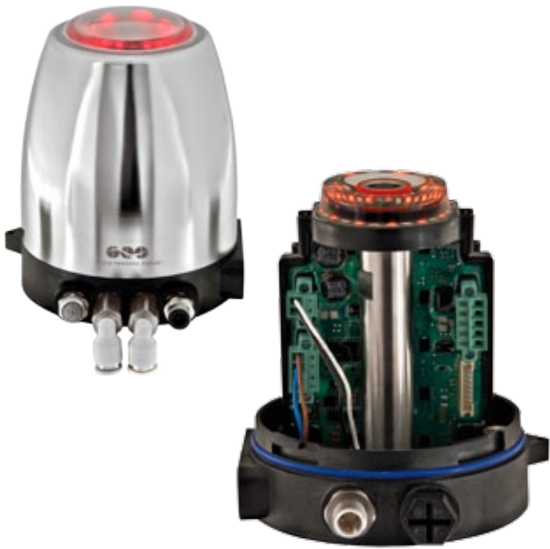
KIESELMANN valve control KI-TOP with SPS or ASI-Bus control