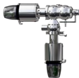
Aseptic pig receiving station