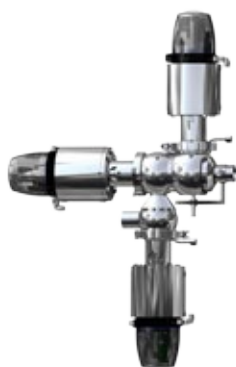
Aseptic pig launching station