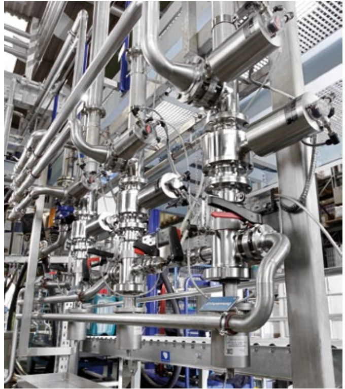
KIESELMANN pigging system in a production plant

Saving time and money rapidly and verifiably, by integrating the KIESELMANN pigging technology in your production. This technology guarantees an almost loss-free emptying of the pipelines. You will reduce the costs in the fields of cleaning, wastewater, energy, and owing to this, this results in a more efficient use of the raw materials.