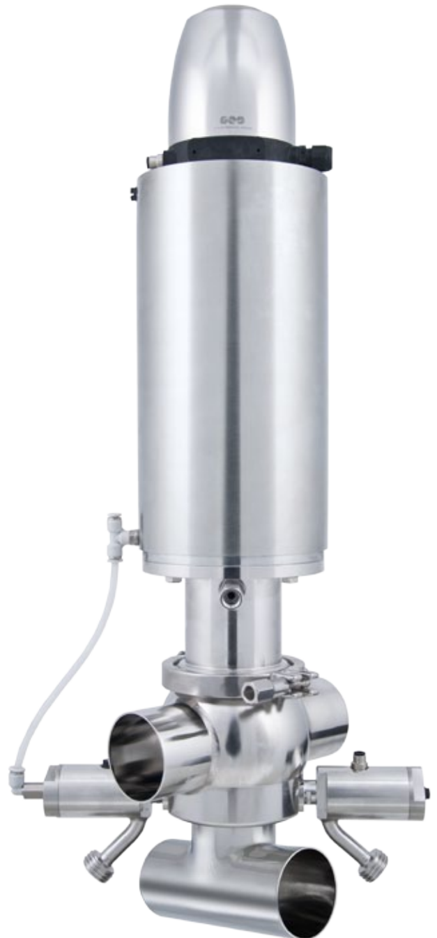
Piggable double sealing single seat valve