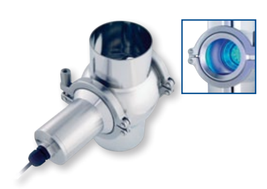
Inline housing with sight glass and LED illumination unit

Other combinations available. Please request details.