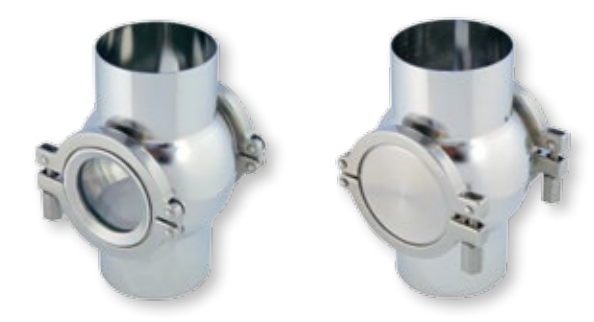
Inline housing with sight glass and blanking plate respectively

We offer the following components for the Inline-system: