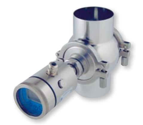
Inline housing with Inline instrumentation